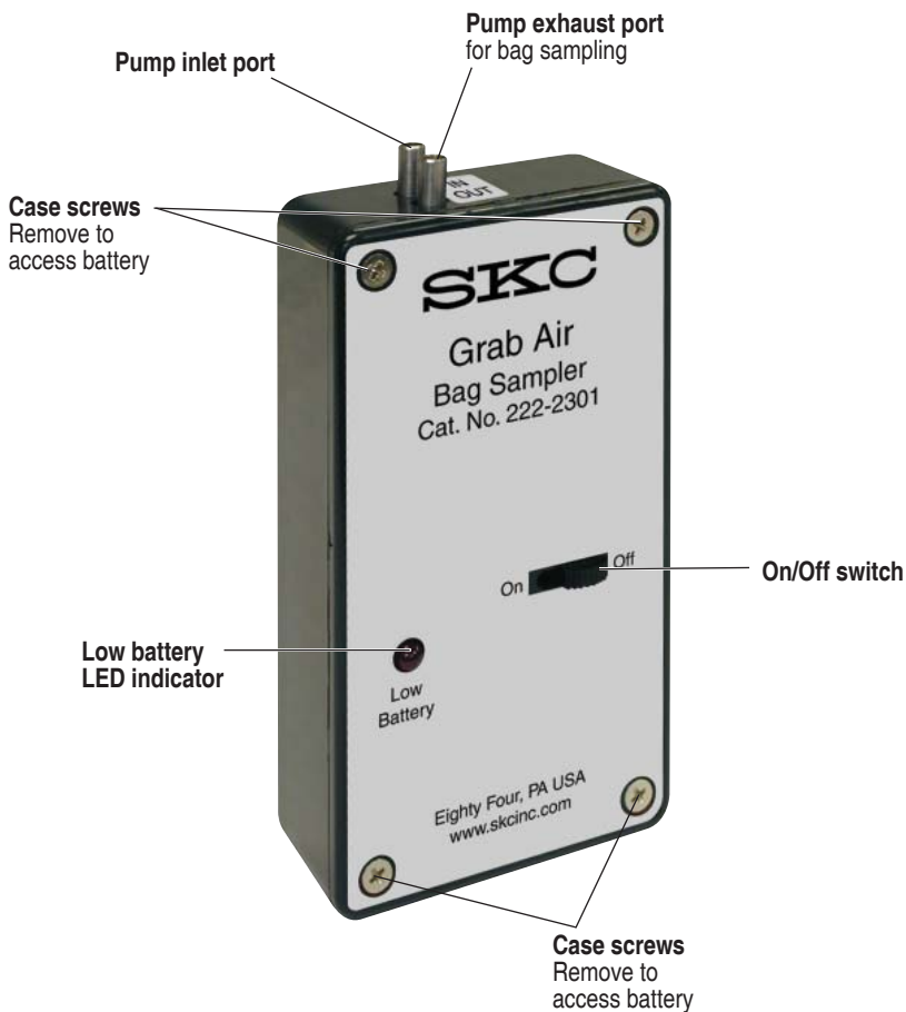
Grab Air Sample Pump, Cat. No. 222-2301

The SKC Grab Air Sample Pump is an economical choice for grab-and-go bag sampling. Grab Air operates at a fixed flow rate of 1 L/min for up to 1000 liters volume on one 9-volt battery. Simply attach a sample bag to the outlet port and turn on the pump. Simple, quick, economical – Grab Air.