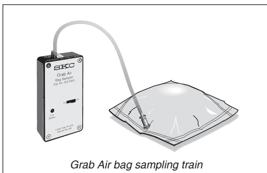
Grab Air bag sampling train

Allow pump to equilibrate after moving it from one temperature extreme to another.