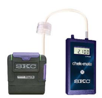
Figure 2. Calibration Train

2. Connect the flowmeter outlet to the inlet of the calibration train using a length of flexible 1/4-inch ID tubing, and if required by the sampler, a calibration adapter. See Figure 2.