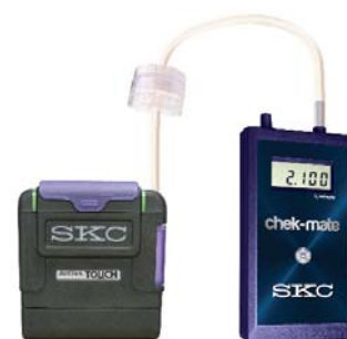
Figure 2. Calibration Train