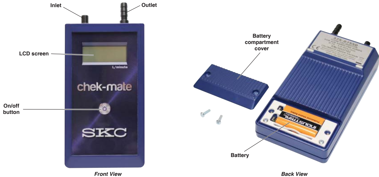
Figure 1. chek-mate Flowmeter

863 Valley View Road, Eighty Four, PA 15330 USA • Tel: 724-941-9701 • www.skcinc.com