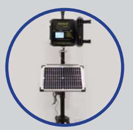
EPAM-7500 on optional tripod with solar panel

Optional ultrasonic wind speed and direction measurement