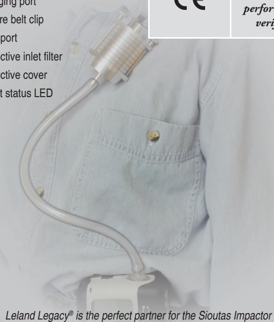
Leland Legacy® is the perfect partner for the Sioutas Impactor