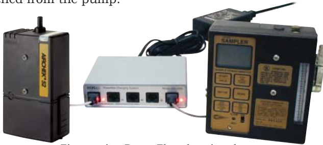
Five-station PowerFlex charging the AirChek 52 and PCXR8

Pump-specific cables are used to connect battery packs to the PowerFlex. Simply plug the appropriate cable into a PowerFlex port and plug the other end into the appropriate pump charging jack. An LED indicates charge mode. PowerFlex charges most battery packs within six hours and automatically switches to a safe pulse trickle charge when full charge is detected. Each attached battery pack runs through an independent charge cycle. Battery packs can be charged either attached to or detached from the pump.